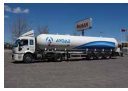
45 m³ 3 Axles Air Suspension