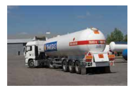
45 m³ 3 Axles Air Suspension